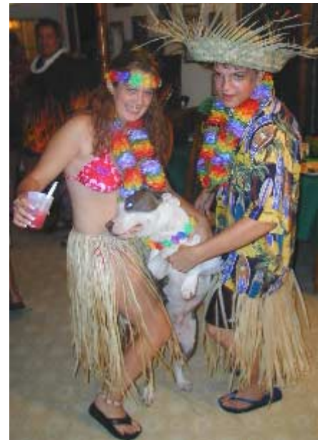
Even Pets Can Have Fun

discriminate between longboard and short; make two instead.