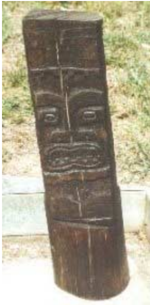
My Entry Way Tiki

main dish prize with Pigs in a Blanket cooked in a pineapple flavored sauce that was tremendous. Basically, anything goes on the dishes.