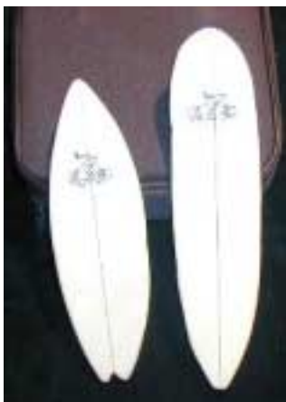
ASC Sacrificial Boards

Best main course dish, best dessert dish, best female costume, best male costume.